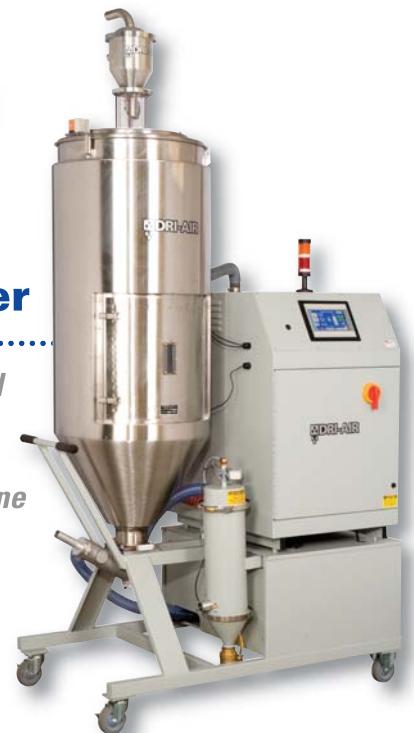
HPD with integrated hopper loader